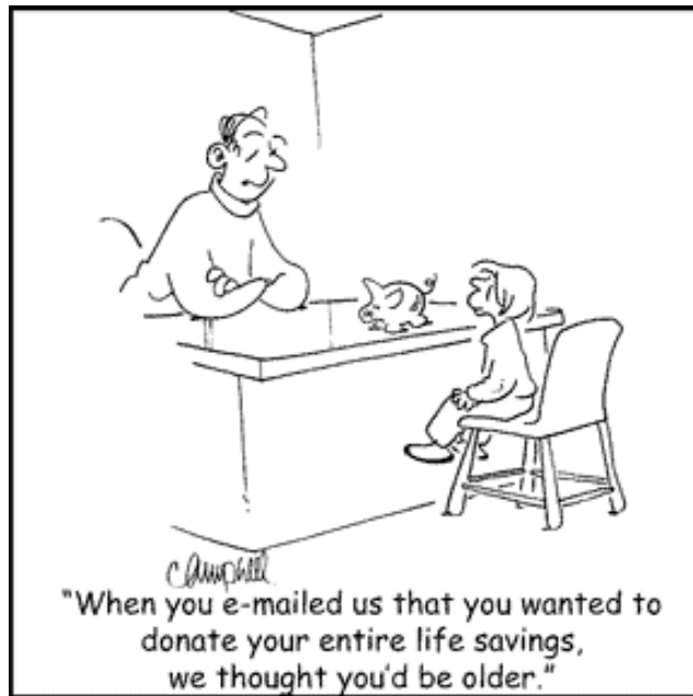
From a church newsletter:

MANNA ON MAIN STREET: We will collect non-perishable food items (boxed cereals, canned meats, canned fruits, canned vegetables, rice, pasta, canned beans, peanut butter, jelly, soups), and toiletries (toilet paper, paper towels, soap, toothpaste, shampoo, deodorant, baby diapers and wipes) for the local Lansdale food-bank thru Easter Sunday. Please place your donations in the designated box in the Guild Room.