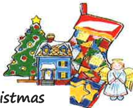
Christmas Past Booth

WE ALSO NEED HELP CLEANING UP THE KITCHEN AFTER THE BAZAAR.